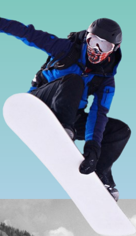
Bardonecchia, location of Olympic snowboarding events, about 58 miles due west of Turin.

An old postcard of Marmora, about 100 miles southwest of Turin, home to my dad's parents before their immigration to California.