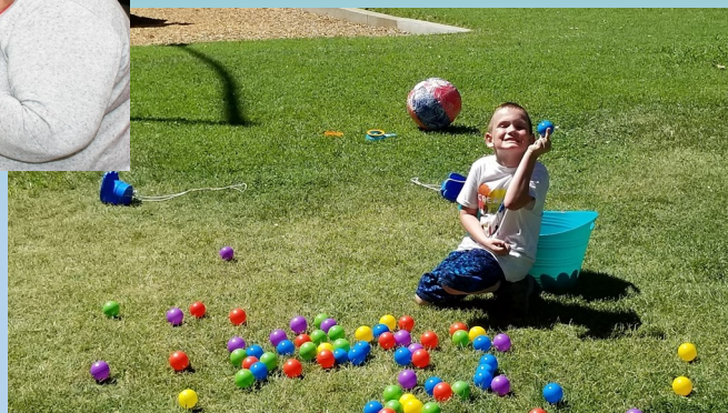
District Picnic 2019