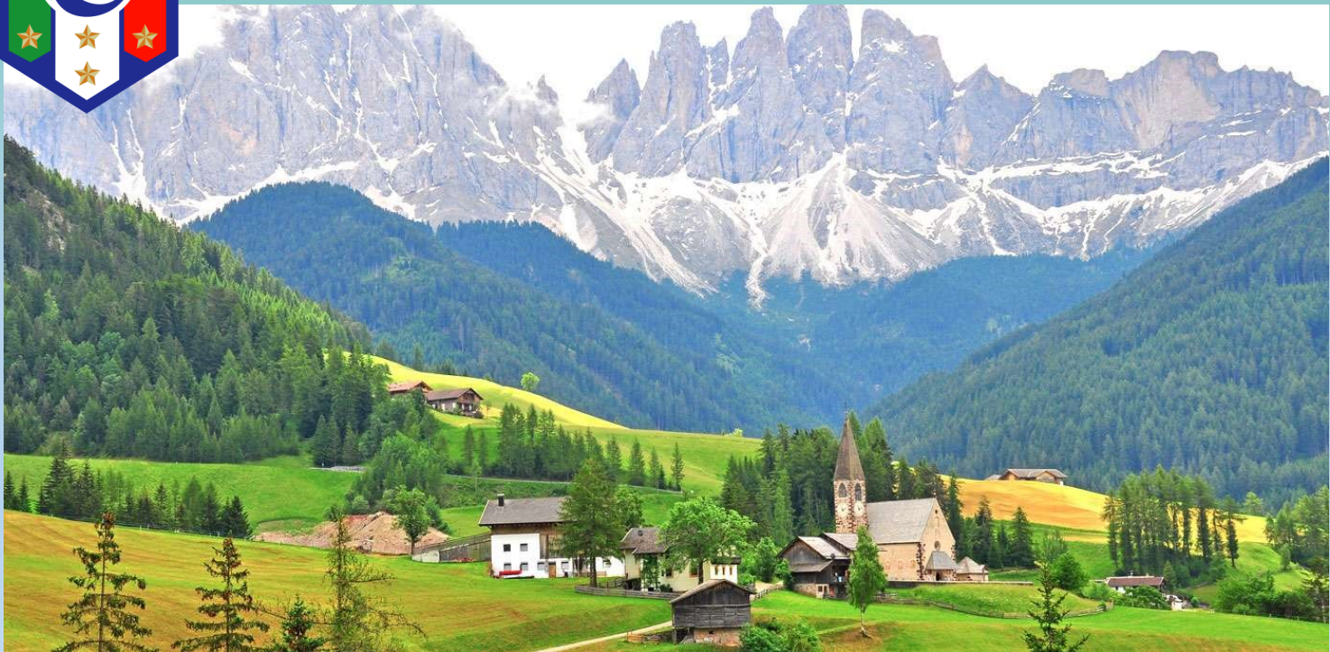
Valley of Valtellina in the Alps in Lombardi.