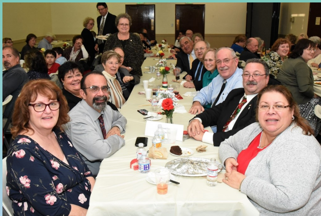
Officers Installation 2020